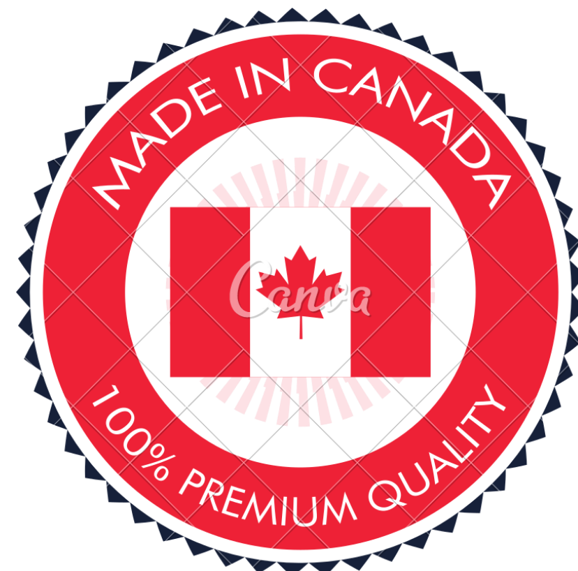
ETERNITY :ECAHN9598# RESPIRATOR

Original certification of Medical Respirator Model ECAN95, single-use and disposable, 95PFE-L2. Meet the Code of Federal Regulation 42 CFR Part 84, Subpart K and the Code of Federal Regulations, Title 16- Commercial Practices, ASTM F1862-17 CSA TechNote TN202